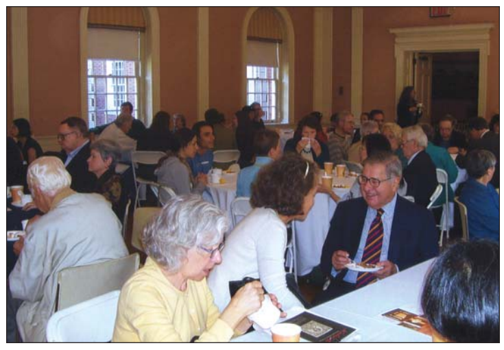
Luncheon at The New Haven Museum