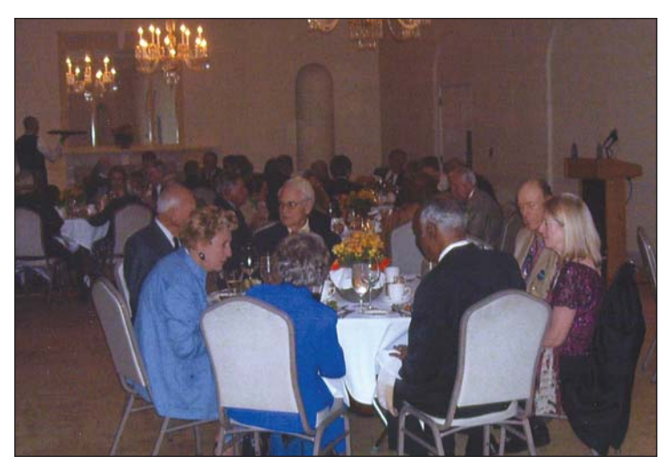
Webster Birthday Dinner at the New Haven Lawn Club