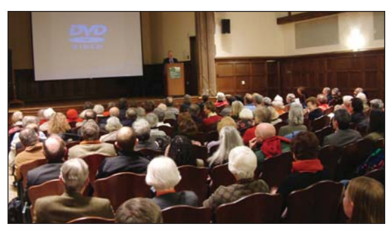
Premiere audience at Whitney Humanities Center

Although it was indeed "a dark and stormy" late afternoon on Friday, February 1, over 200 stalwart members of the Friends organization and invited guests braved the wind-whipped walls of water to attend the premiere showing of the Cemetery's just-released DVD, "Grove Street Cemetery — City of the Dead, City of the Living." Among those attending were several of the individuals shown in the DVD being interviewed at the Cemetery The cost of the project was underwritten jointly by The Standing Committee of the Cemetery's Proprietors and by the Board of The Friends of Grove Street Cemetery, Inc.