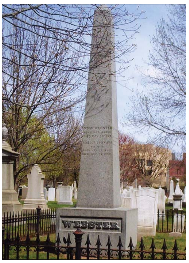
Noah Webster's Monument 250th Birthday Celebration October 16 & 17, 2008

e-mail: office@grovestreetcemetery.org website: www.grovestreetcemetery.org